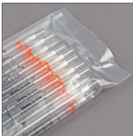
Bulk pipettes are packaged in 25-piece bags and are available sterile or non-sterile. (The 50mL bulk pipettes are available in sterile only.)