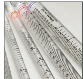
Crisp and bold easy-to-read graduation marks