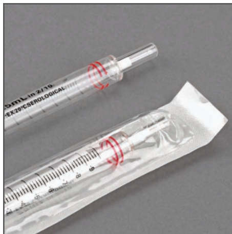
The individually wrapped pipettes are sold sterile in easy-to-open polyethylene/medical grade paper peel packs.